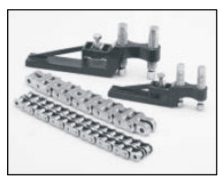
10" -36" and 6"-20" clamping feet. Heavy duty chain is also available